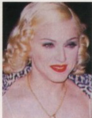
BUFFALO HERD, FROM LEFT: CRUISE AND KIDMAN; ROBERT DE NIRO; CARREY AND GIRLFRIEND LAUREN HOLLY; MADONNA. RIGHT: HALL OF MIRRORS