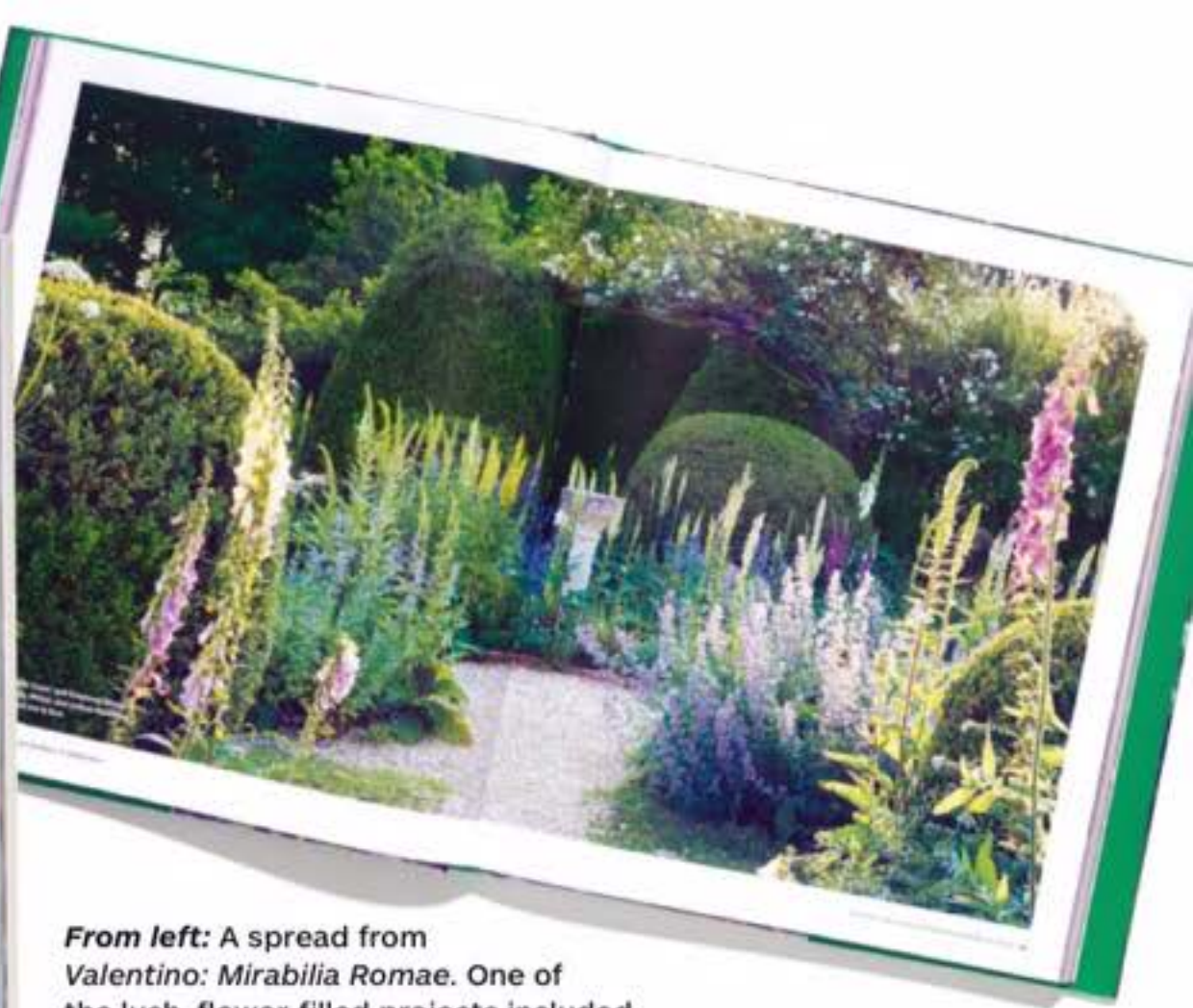
From left: A spread from Valentino: Mirabilia Romae . One of the lush, flower-filled projects included in Outstanding American Gardens .