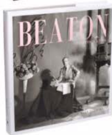
Above: Four more titles from this season's rich harvest of design books. Below: An elegant guest room by Carrier and Company Interiors, featured in the firm's new monograph.